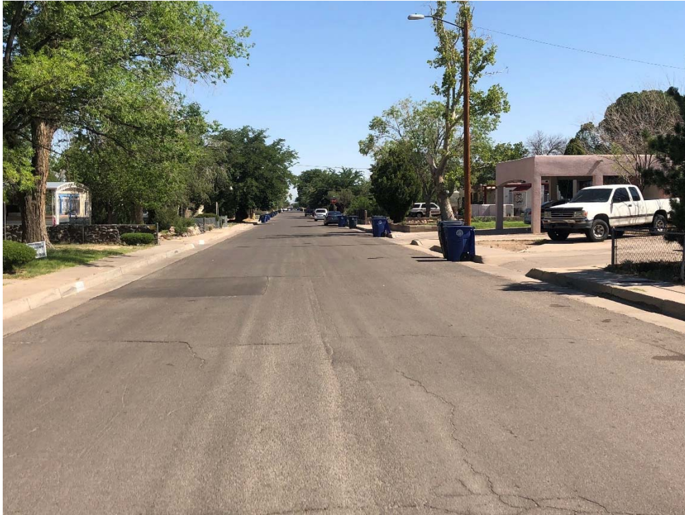
Figure 3: Arizona Street looking north