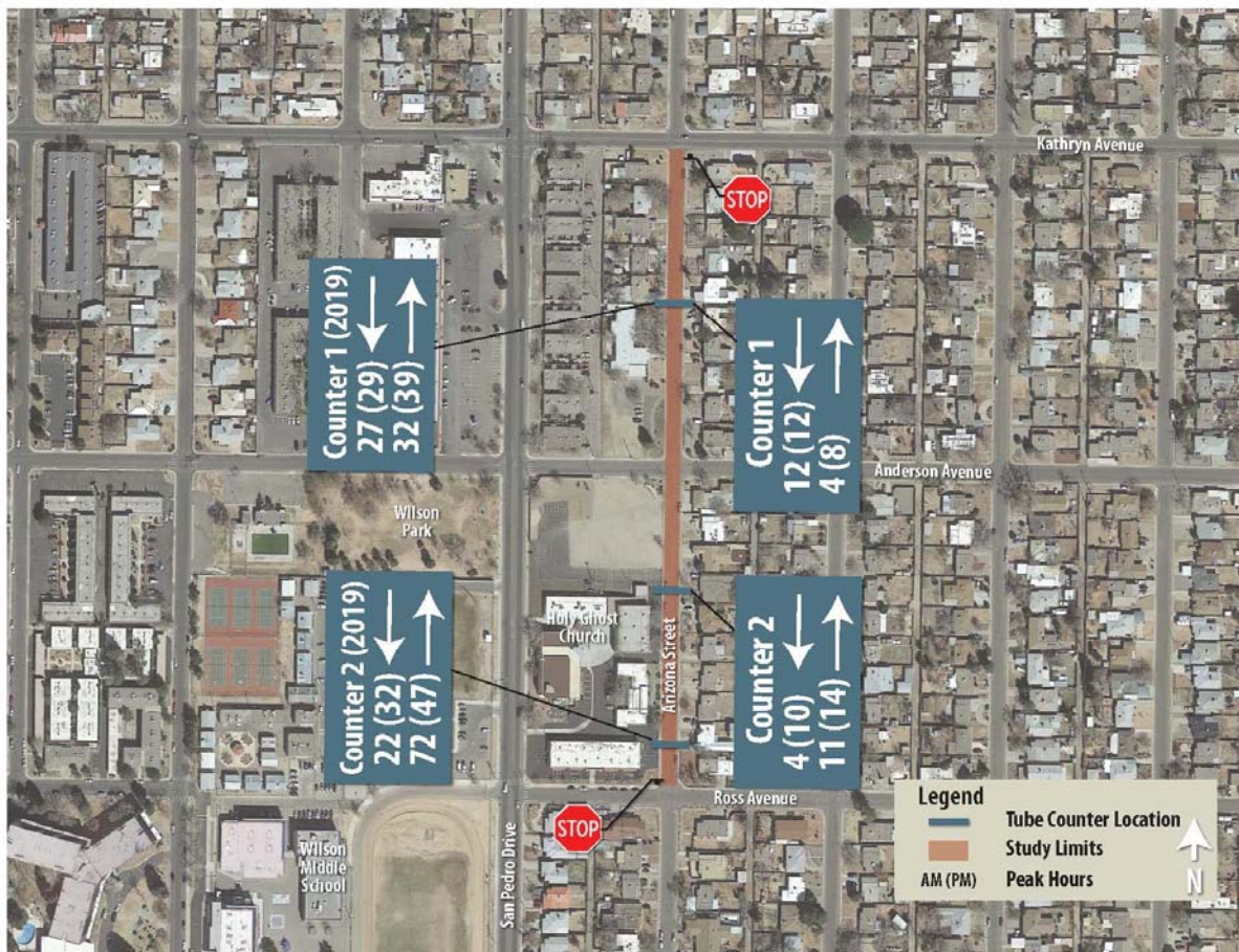
Figure 1: Project Area and Existing Traffic Volumes

The Arizona Street project is located in Albuquerque, New Mexico and is approximately 0.25 miles (1329 feet) in length. Arizona Street is a two-lane, undivided local street that runs north-south, from Kathryn Avenue to Ross Avenue. Kathryn Avenue is a two-lane, undivided local street that runs east-west and intersects the north end of Arizona Street at a cross-intersection. Ross Avenue is two-lane, undivided local street that runs east-west and intersects the south end of Arizona Street at a cross-intersection. The Holy Ghost Catholic Church is located immediately west of Arizona Street between Anderson Avenue to Ross Avenue, See Figure 1 for a map of the project area.