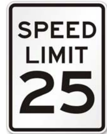
Figure 2: Arizona Street Speed Limit

Arizona Street is a 28-ft wide roadway with curb and gutter, and 3.5-ft wide sidewalks. On-street parking is also available on both sides of the roadway. See Figure 3 and 4 for photos of the existing Arizona Street, and Figure 5 for the existing typical section along Arizona Street.