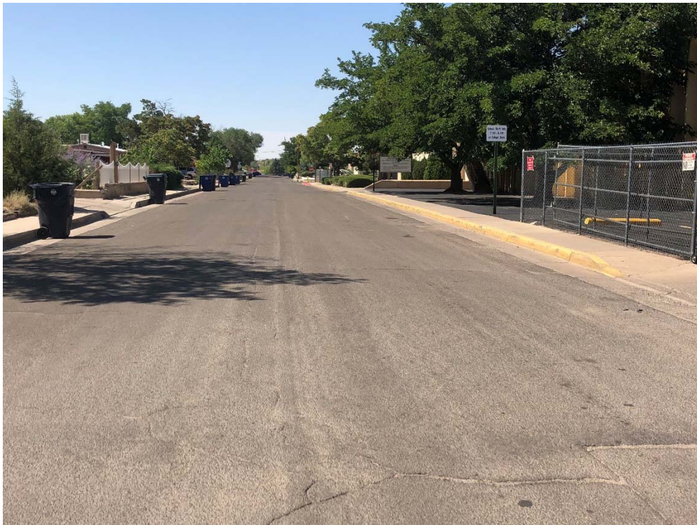
Figure 4: Arizona Street looking south